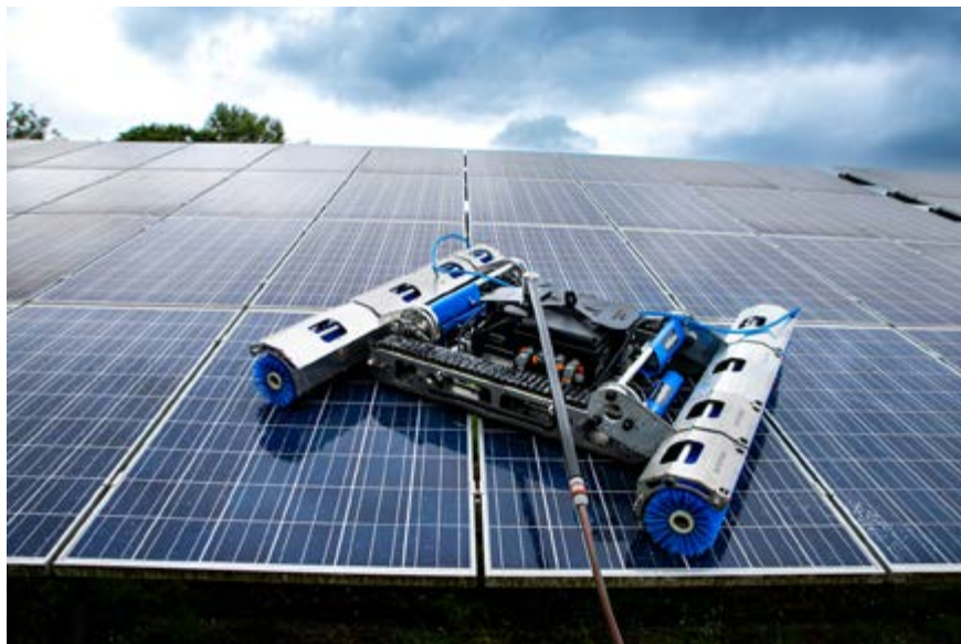
sunbotics cleaning robot

Here, people were already eagerly awaiting the practical test, after all, the idea of a photovoltaic cleaner was born from the house of Bremer & Leguil together with ONESOLAR . The idea of cleaning PV modules was already being considered during a demonstration of the cleaning of transformers.