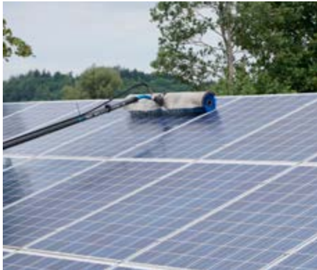
Rivolta P.H.C. is suitable for manual cleaning and abseil cleaning with brushes...