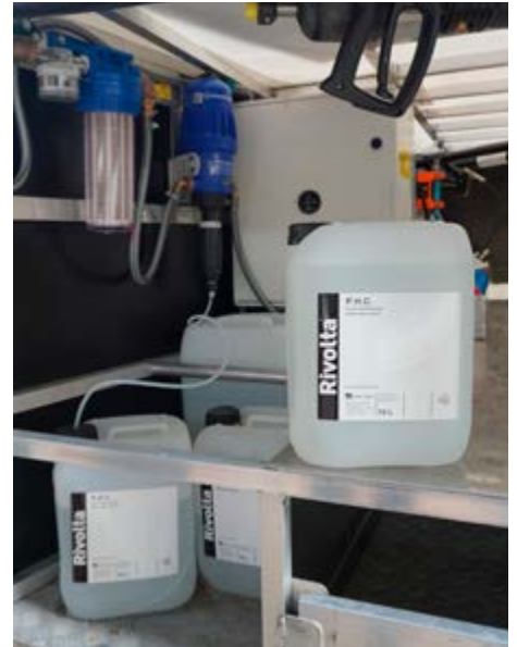
Rivolta P.H.C. is supplied as a concentrate and must be diluted with water before use.

An important point that Christoph Haas also endorses: “Because at ONESOLAR we attach great importance to nature conservation and Rivolta P.H.C. is easily biodegradable, it is perfectly suited for cleaning our ground-mounted solar